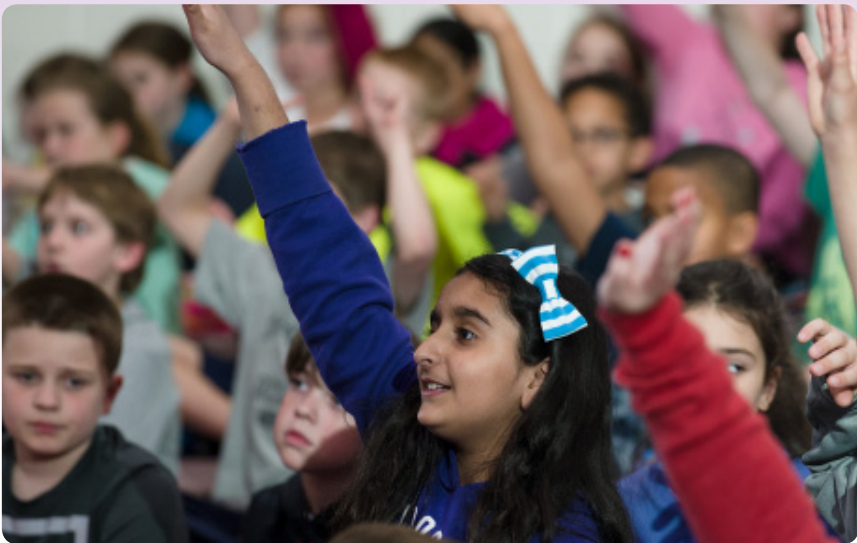
Spirit of America: Maryland